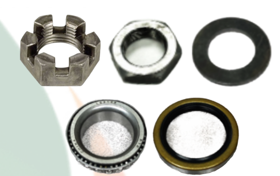
Spindle Nuts, Washers Bearings & Grease Seals