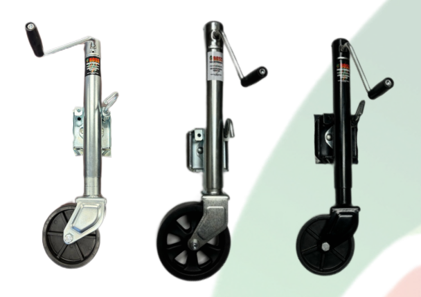
Bolt-on and Weld-On Swing Away Jacks in Zinc Plated and Black finishes from 1,000 to 1,500lb Capacity