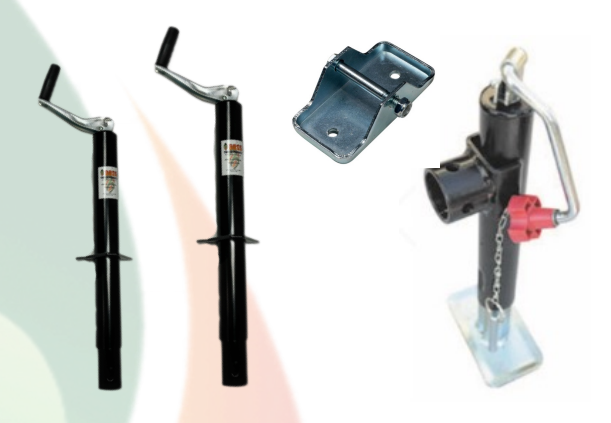
A-Frame and Pipe Mount Jacks in Black finish from 1,500 to 5,000lb Capacity