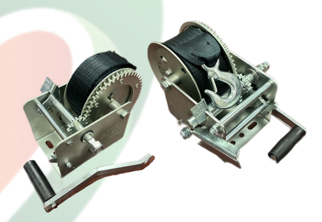
Two-Speed Winches in Zinc Plated Finish from 2,600 to 3,700lb Capacity (3,200 & 3,700lb have brake)