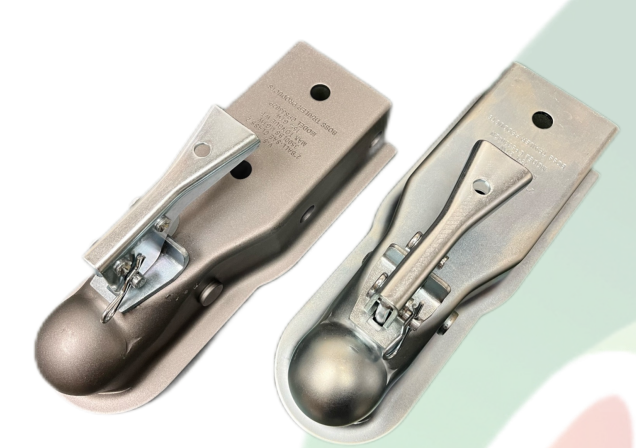
Straight Couplers in Plain & Zinc Plated finishes. Class 2 (3,500) and Class 3 (5,000) Capacity