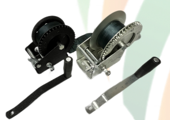
Single Speed Winches in Zinc Plated and Black finishes from 900 to 1,800lb Capacity