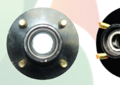
Hubs and Hub Kits