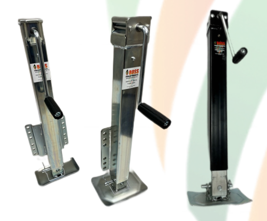
Bolt-on and Weld-On Drop Leg Jacks in Zinc Plated and Black finishes from 2,500 to 7,000lb Capacity