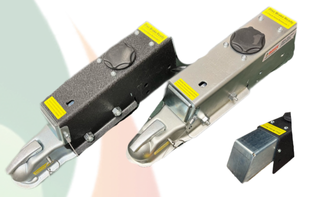
Drum & Disc Brake Actuator, 6,600lb Capacity in Black and Zinc Plated finishes. Rear cover available