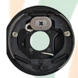
Drum Free-Backing Backing Plates in 10" and 12", Hydraulic and Electric actuation