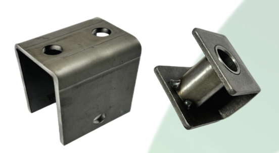
Axle Spring Hangers