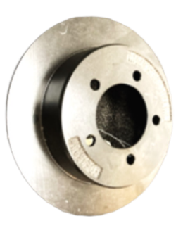
10" Disc Brake Rotors and Calipers in multiple configurations.