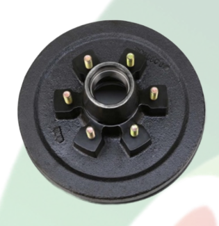
Drum Hubs in 10" and 12" sizes, Black Painted finish