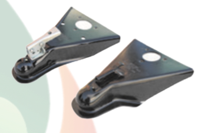
A-Frame Couplers in Plain & Black finishes. 3,500 to 14,000lb Capacity