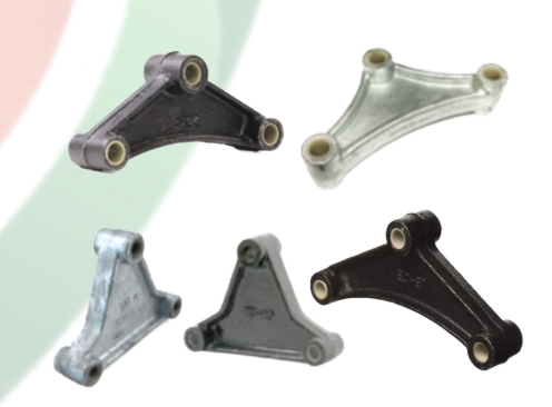
Cast Equalizers in Black & Galv finishes