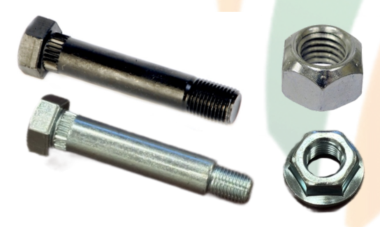
Shackle Bolts & Nuts in Plain & Zinc Plated finishes